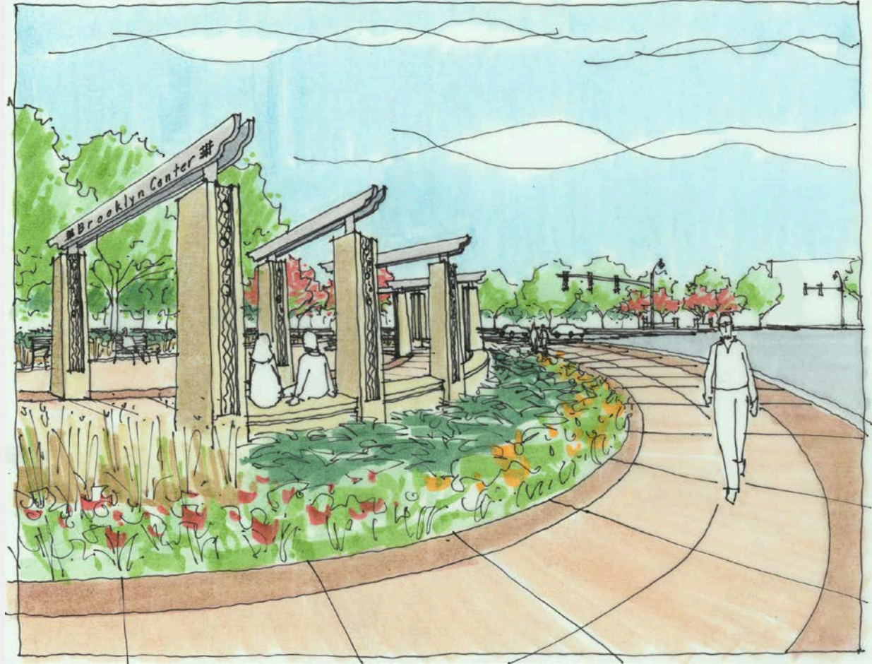
Sketch of streetscaping elements for Bass Lake Road intersection