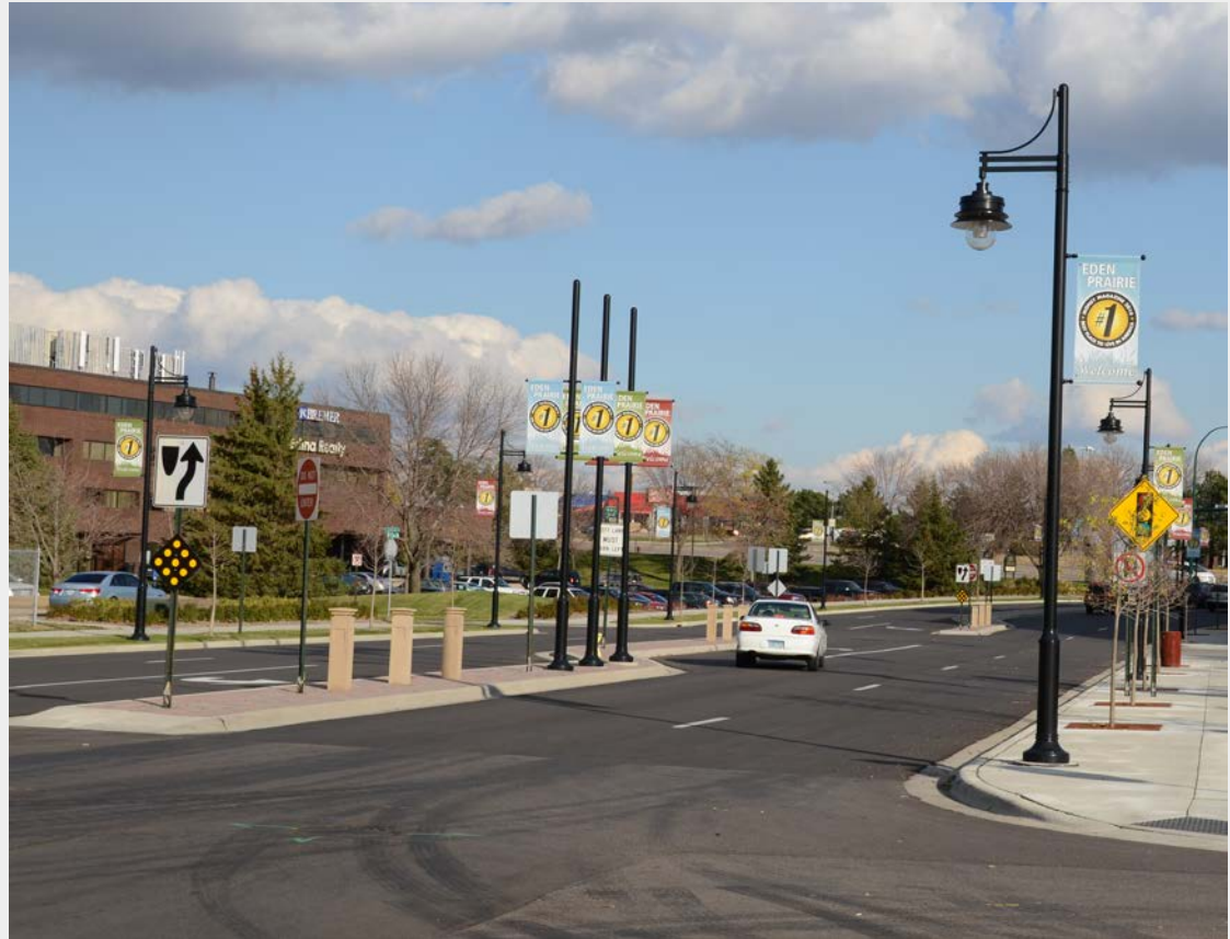
Example of median with bollards and signs – Eden Prairie